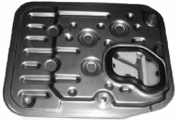
195 27 01 VW 096, 097, 098, & 01P