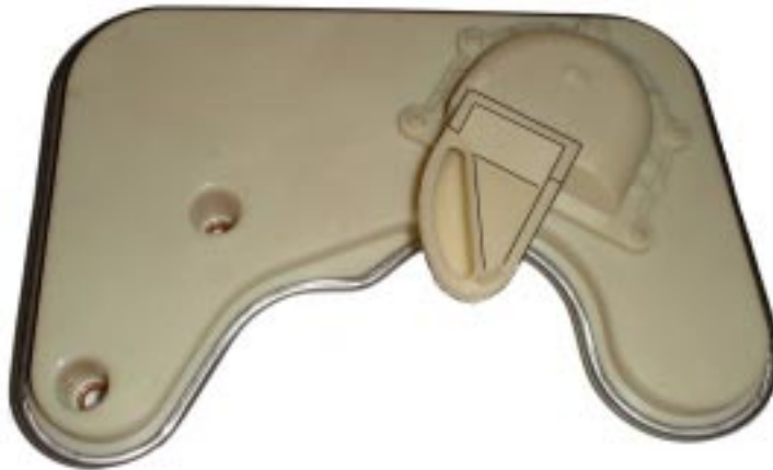
195 27 02 Renault AR4