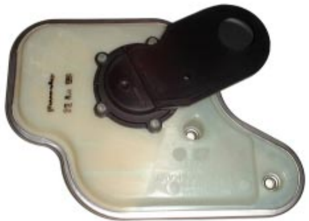
195 27 06 Renault AD8