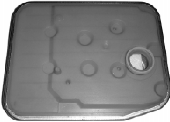
195 27 07 Ford Galaxy 01M