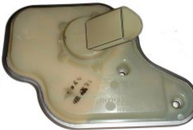
195 27 05 Renault AD4